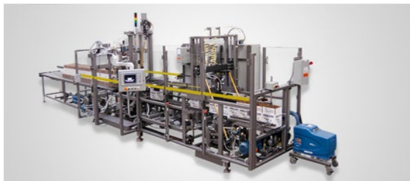
VCE CASE ERECTOR

which lubricant points are centralized outside of the system. Our Total Planned Maintenance (TPM) system, an optional add on, will inform you of regular maintenance tasks, with full color instructions on the color touch screen.