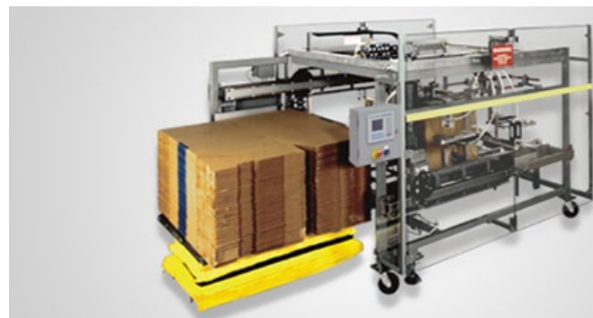
WAYNE AUTOMATION CE-24/30 CASE ERECTOR

Wayne Automation sets the gold standard for tablock (Tablok) cases, and for this task we offer multiple different erectors. The MOD B series offers servo driven performance with a 40 CPM throughput while the CE-20/30TL handles large format Tablok cases at up to 35 CPM.