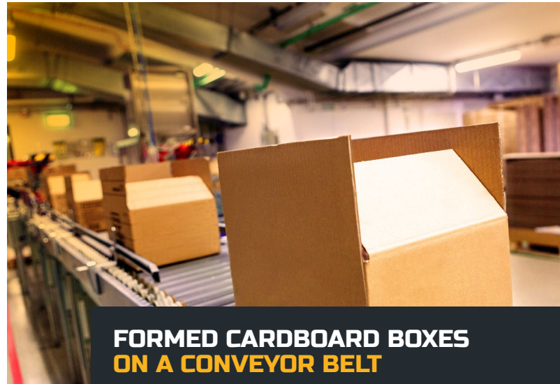
FORMED CARDBOARD BOXES ON A CONVEYOR BELT

Each of these industries prizes efficiency of production and staying on the cutting edge of manufacturing technology. Case Erectors can be produced in automatic, hand loaded and fully robotic configurations, giving you the flexibility to pick the option for your need, whether you're retrofitting an existing product line or building a new one from the ground up. Additionally, Case Erectors can utilize toolless changeover, keeping up with the demands of a changing production environment and the packaging to go with it.