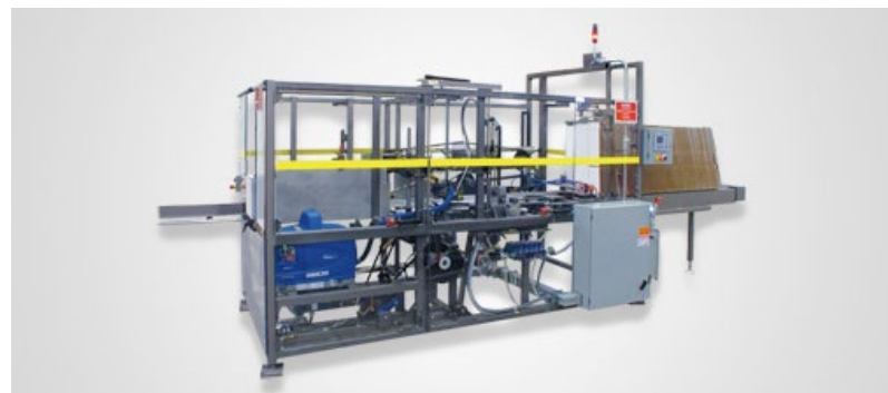
WAYNE AUTOMATION CE-2100 CASE ERECTOR

Dekka tape head for 2" or 3" tape. Additionally, the CE-2100 can handle RSC, HSC and AFM style cases, providing you with compact versatility in an entry level system.