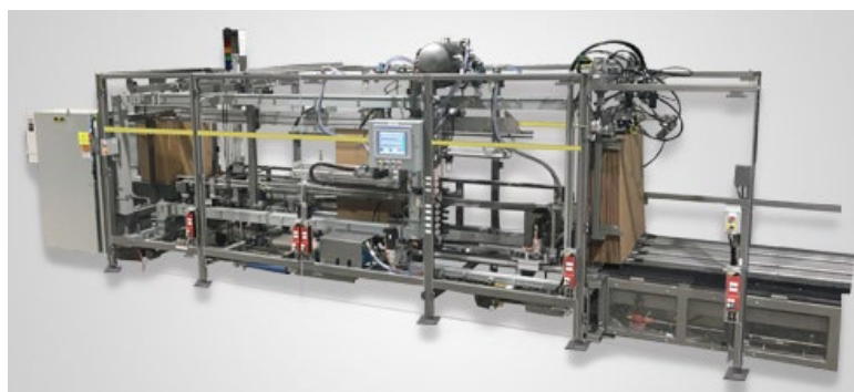
WAYNE AUTOMATION WLRV-CE CASE ERECTOR

The WLRV-CE Case Erector can produce up to 35 cases per minute in both RSC and HSC styles, featuring a hot glue melt system, and our standard suite of safety features, including lexan safety doors and automated anti intrusion switches.